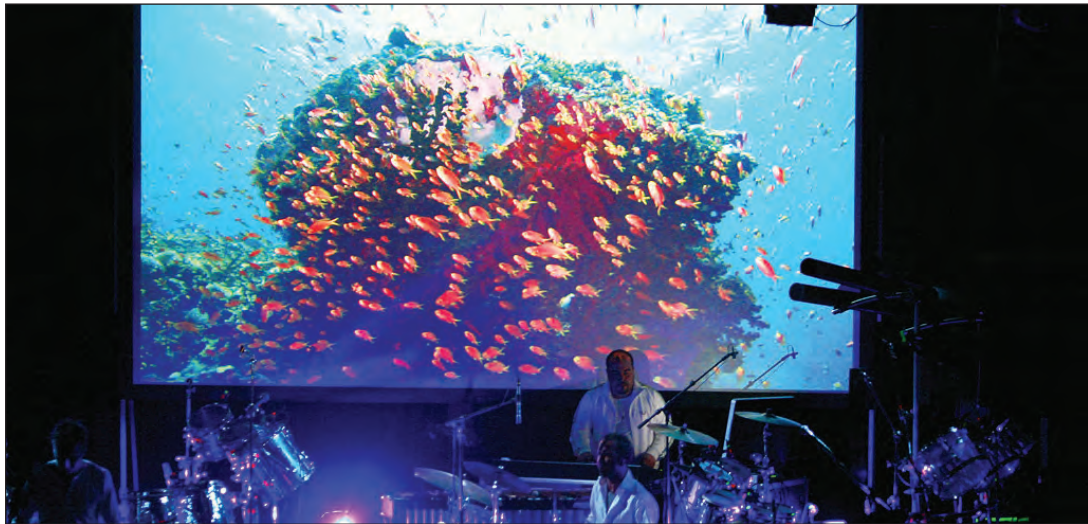
• AQUA was shown on multiple screens during its special preview screening at Copenhagen.